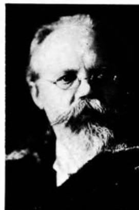
DINNER TO PROF. ENGELBERT HUMPERDINCK, December 30, 1910: Speeches by Rubin Goldmark, Otto Goritz, Alfred Hertz, Walter Damrosch; Songs by Harry Burleigh; humorous en-tertainment by Otto Goritz.